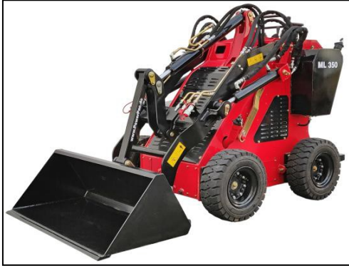
optional with wheels